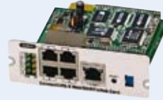
ConnectUPS Web/SNMP Card

The standard unit is equipped with USB and RS-232 serial ports to communicate with power management software. You can customise your UPS by adding an interface card for other applications: