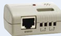
Environmental Monitoring Probe

Independently manage diverse servers. A Multi-server Card enables up to six serially connected devices of mixed operating systems to be independently managed and controlled by a single UPS.