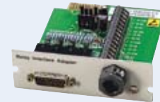
Relay Interface Card

Interwork with you existing Building Management System. A Modbus® Card enables real-time monitoring of UPS systems through a Building Management System or Industrial Automation System.