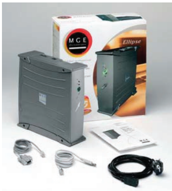
Complete solution (USBS models are supplied with USB and serial port cables, Personal SolutionPac on CD-ROM)