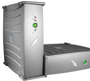
(optional 2U kit)

The best compatibility with computer equipment